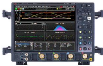
1 mm input models

The UXR is available in three models based on bandwidth, sample rate and input connector size. Infiniium UXR-Series models offer bandwidths from 5 GHz to 110 GHz with various 1-channel, 2-channel, or 4-channel configurations available. The 3.5mm models are equipped with Keysight AutoProbe II interfaces while 1mm and 1.85 mm models incorporate an advanced high-performance high-bandwidth Keysight AutoProbe III interface.