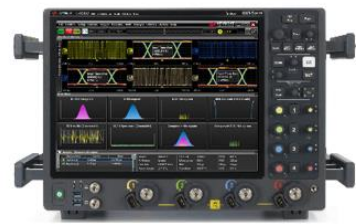
3.5 mm input models