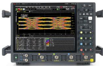
1.85 mm input models